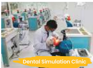
Dental Simulation Clinic