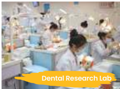
Dental Research Lab